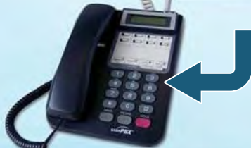
LCD Handsets Available In White & Black